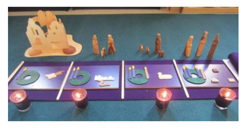
Week 4 (Storytellers perspective)

Look at youtube — this gives you a really good idea of what the complete story looks like by week 4 Godly Play VBS Journey To Bethlehem: https://www.youtube.com/watch?v=iEaf16CK7m8